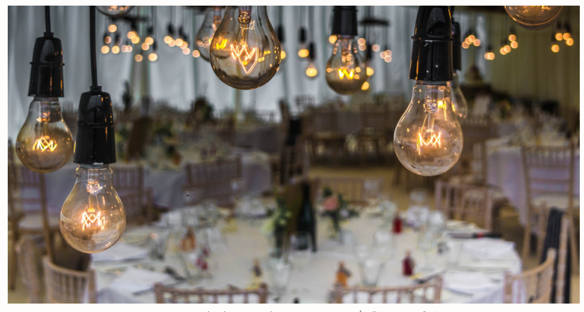
www.clubmanly.com.au | Page 01

A minimum of fifty (50) guests for each Function Room booking applies. Options will be provided for receptions fewer than fifty guests. DIY packages also available.